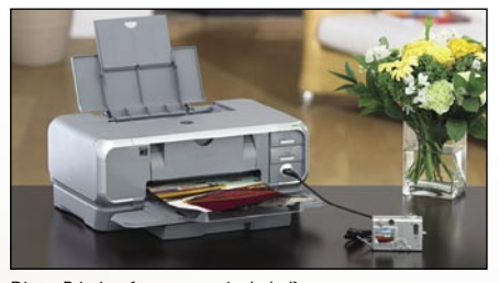
Direct Printing (camera not included)