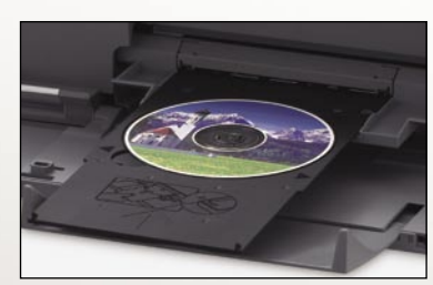
Prints directly on CD-R and DVD-R media