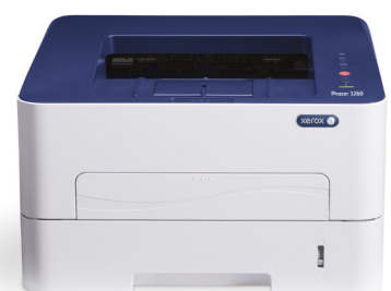
Phaser 3260. Print.