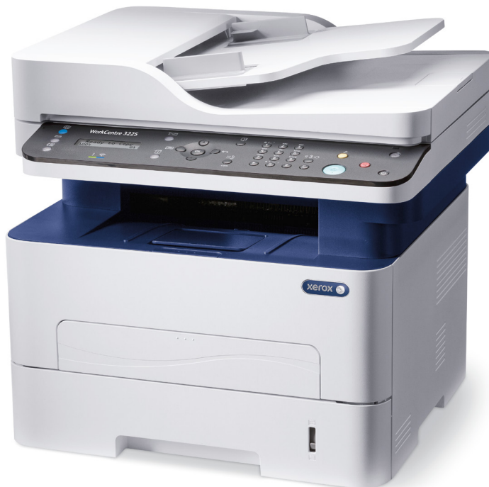
WorkCentre 3225. Copy. Print. Scan. Fax. Email.