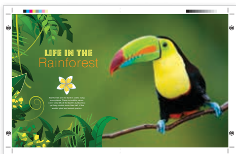
Oversize output for A3 bleed

With the Xerox® VersaLink® C9000 Colour Printer, you can create finished pieces on a wide range of media to match the designer's intent.