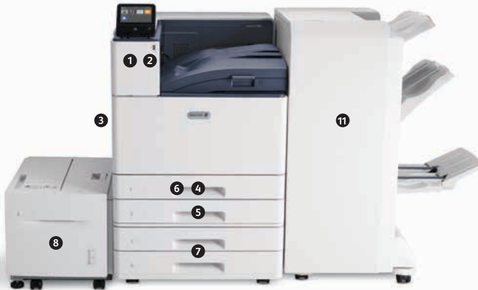
Xerox® VersaLink® C9000 Colour Printer Print. Mobile connectivity.

1 Card Reader Bay and internal card reader compartment.