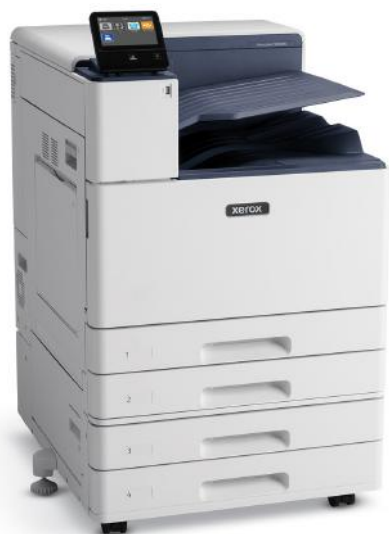
VersaLink® C8000W plus Two Tray Module