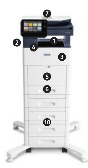
Xerox® VersaLink® C505 Colour Multifunction Printer Print. Copy. Scan. Fax. Email.