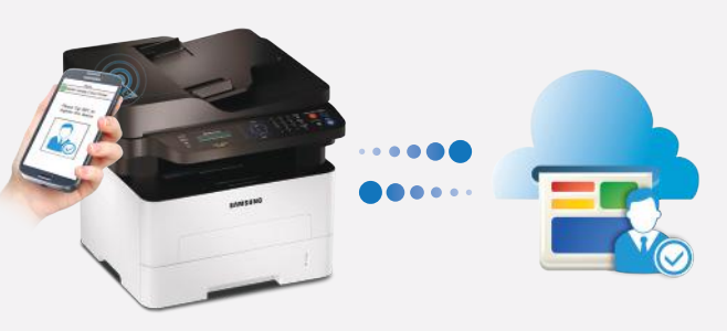
Tap to register