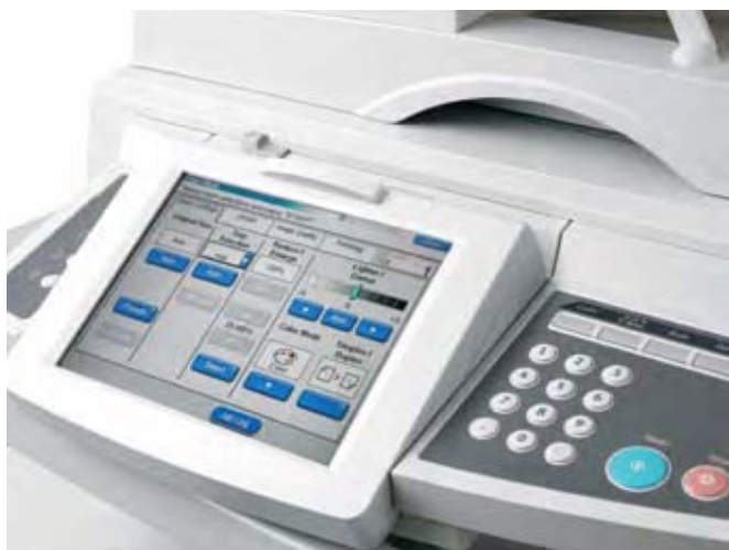
21cm full colour touch-screen display.

The quality is truly impressive. A combination of true 1200 x 1200 dpi print resolution, specially formulated microfine toners and our ProQ4800 multi-level printing technology delivers stunningly good colour with subtler shading and smoother gradations. What's more, the integrated EFI colour management tools ensure absolute precision, time after time.