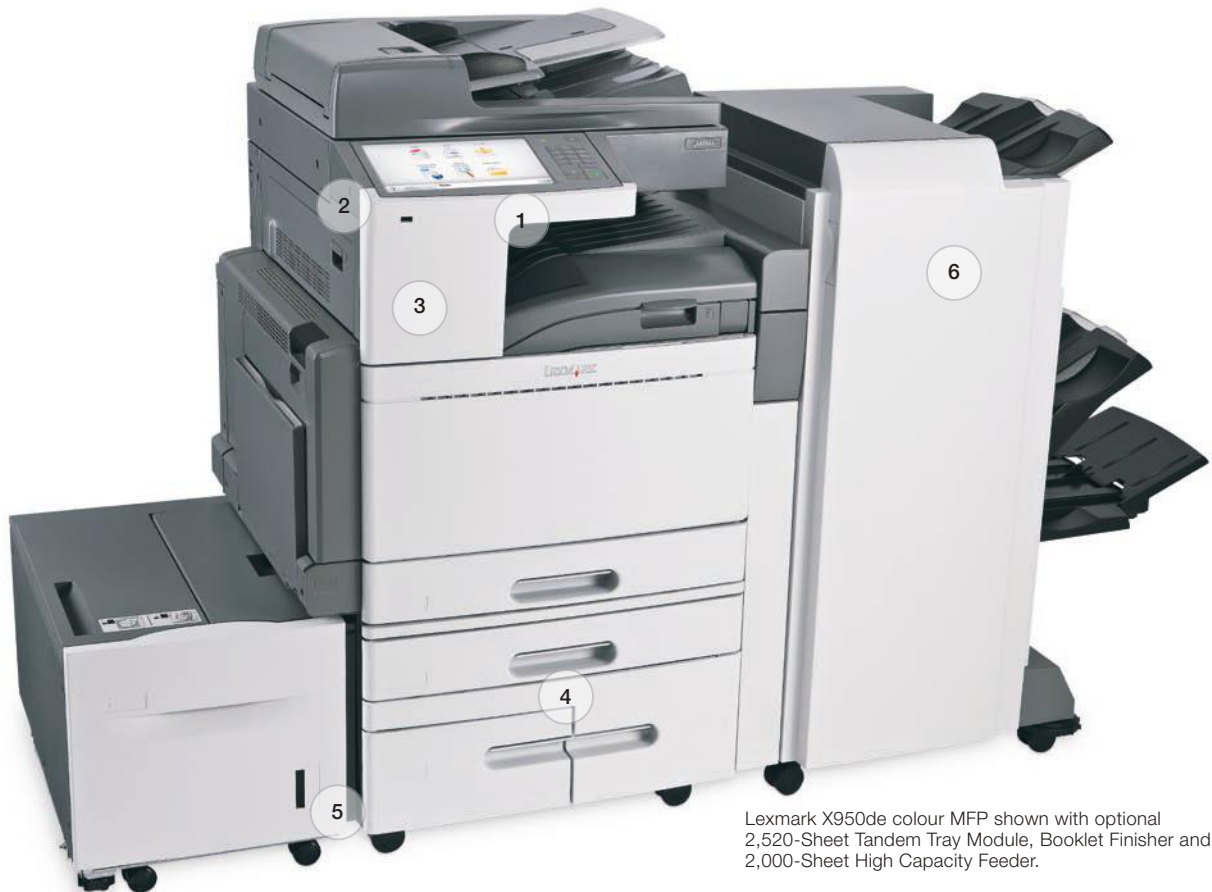
Lexmark X950de colour MFP shown with optional 2,520-Sheet Tandem Tray Module, Booklet Finisher and 2,000-Sheet High Capacity Feeder.