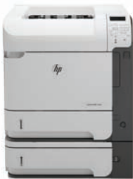
HP LaserJet Enterprise 600 M602x