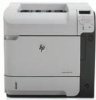
HP LaserJet Enterprise 600 M602dn