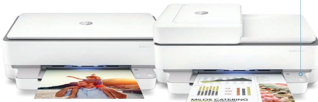
HP ENVY 6000