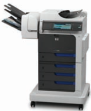
HP Color LaserJet Enterprise CM4540fsm MFP