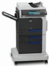
HP Color LaserJet Enterprise CM4540f MFP