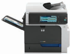
HP Color LaserJet Enterprise CM4540 MFP