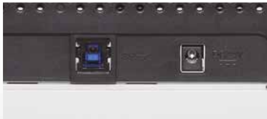
High speed performance through USB 3.0 interface

All four scanner models additionally make use of an ultrasonic sensor that accurately detects multifeed errors where two or more sheets are fed through the scanner at once plus the Intelligent Multifeed Function allows document scan parameters to be applied which enables the sensors to be set up to help identify and subsequently ignore attachments such as sticky notes or items with a photo attached that would otherwise cause disruptions to the scanning process.