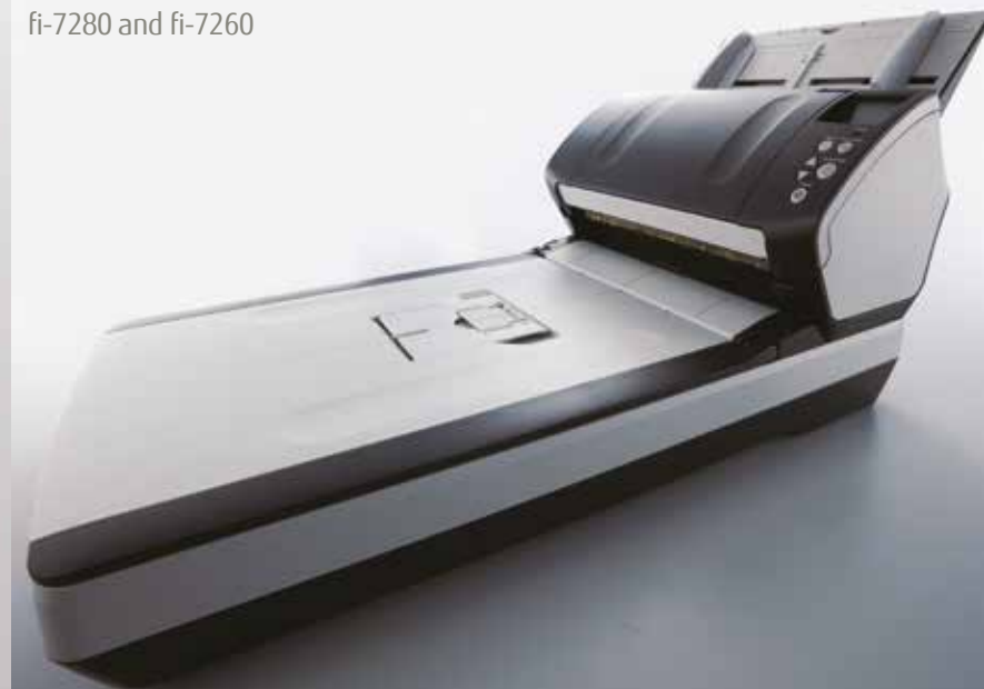
fi-7280 and fi-7260