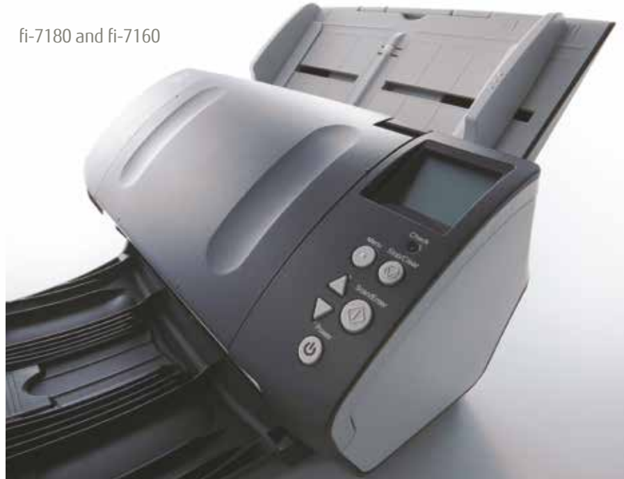
fi-7180 and fi-7160