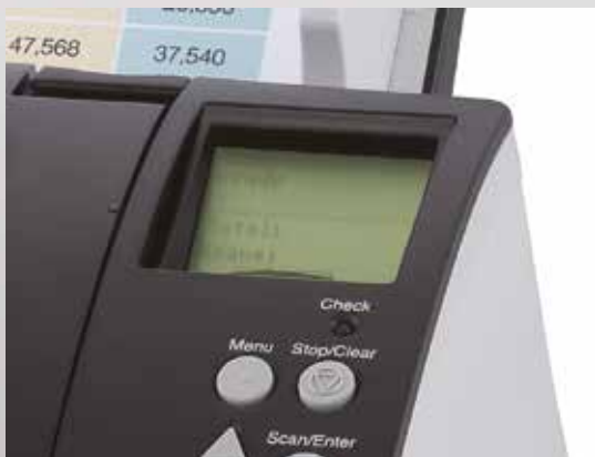
Integrated LCD operating panel

Scanner Central Admin software enable Fujitsu scanners to be managed and maintained from a single location to minimise scanner downtime anywhere on the global system.