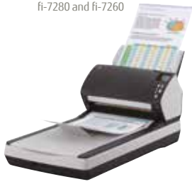
fi-7280 and fi-7260

fi-7160 / fi-7260 – A4 Portrait at 300 dpi 60 ppm / 120 ipm fi-7180 / fi-7280 – A4 Portrait at 300 dpi 80 ppm / 160 ipm Scan mixed batches through the 80 sheet ADF