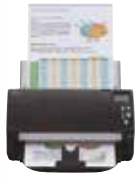
fi-7180 and fi-7160