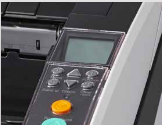
Integrated LCD operating panel

Fujitsu's fi-7800 and fi-7900 deliver the complete scanning solution. A combination of our market-leading scanner, software and service give you everything needed for a more productive system and more productive people, allowing you to focus more on your business and less on your technology.