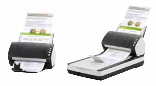
fi-7140 / fi-7240 – A4 Portrait at 300 dpi 40 ppm / 80 ipm Scan mixed batches through the 80 sheet ADF