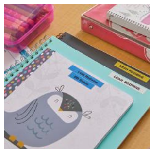
Crafts & Creative