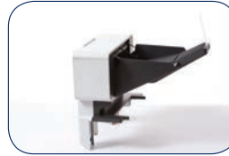
Output Stacker (MX-7100) Up to 500 sheets (maximum of 1)