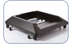
Stabiliser Unit (SB-7100) Recommended when 2 or more optional lower trays are installed for increased stability