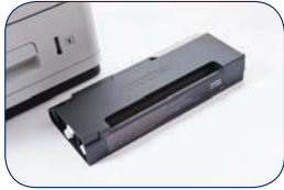
Replacement Ink Cartridge (HC-05BK) Approx. 30,000 pages 1