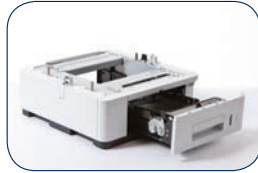
Optional Lower Tray (LT-7100) Up to 500 sheets (maximum of 3)