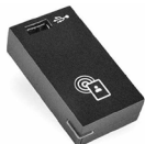
Card Reader 4