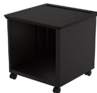
Adjustable Printer Stand