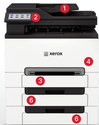
Xerox® C305ae Colour Multifunction Printer