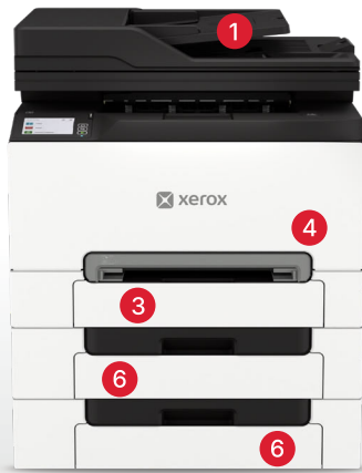
Xerox® C303a Colour Multifunction Printer