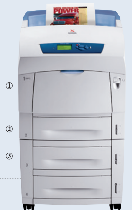
Phaser 6250DX colour printer

Money-saving and fast automatic duplex option for two-sided printing (standard on DP, DT, DX configurations).