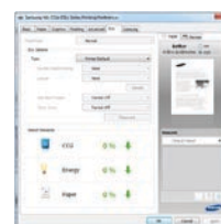
ECO mode off

The unique Samsung Result Simulator expands this further by providing a graphic representation of how much you can save on your Carbon Footprint, power consumption and paper usage, depending on the options you select.