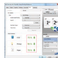
ECO mode on Duplex, 2-up Printing