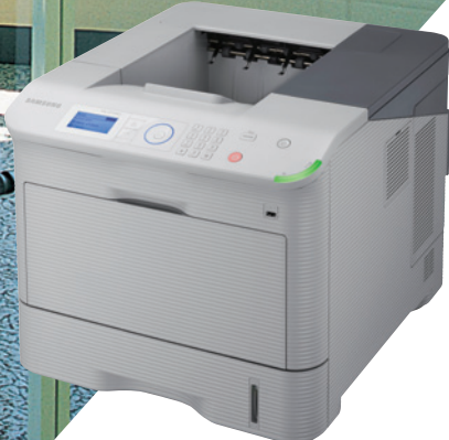
Samsung Mono Laser Printer ML-5510ND/ML-6510ND