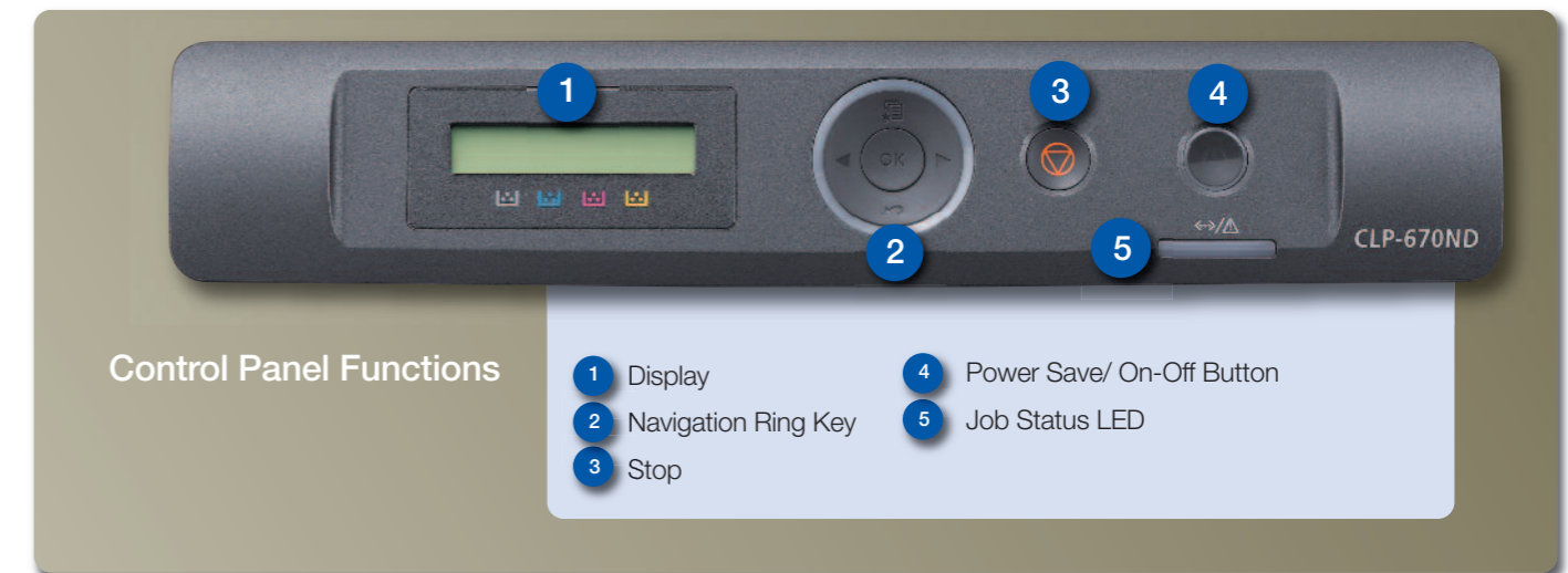
Control Panel Functions