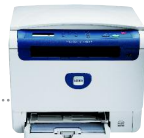
print | copy | scan