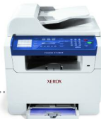
print | copy | scan