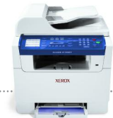
print | copy | scan | fax