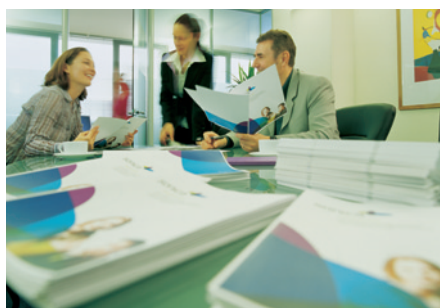
Saddle-stitched customer brochures