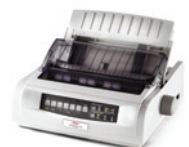
Dot Matrix Printers