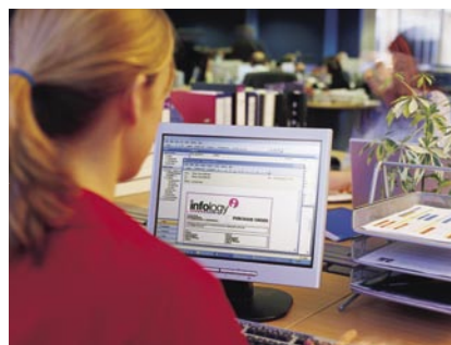
Scan documents and email them directly from your C5500 Series