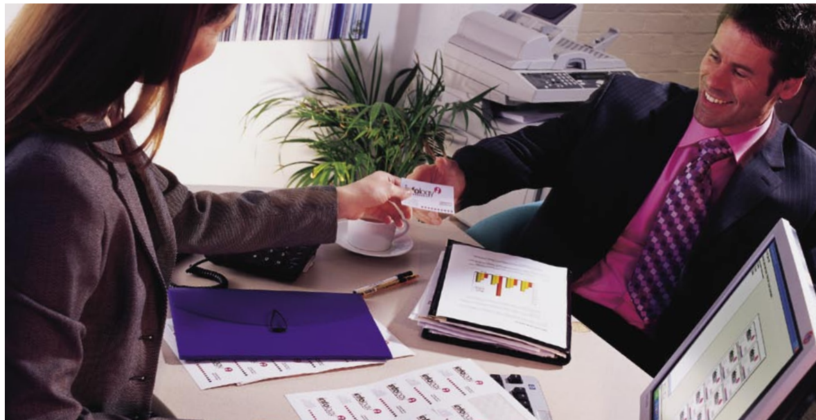
Impressive full colour business cards produced in-house with ease