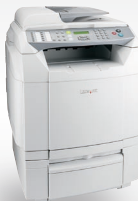
Model shown: Lexmark X502n plus second drawer