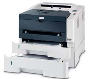
PF-100 Paper feeder

Product depicted includes optional extras