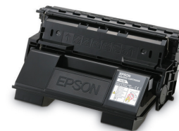
Fuser maintenance kit C13S053038BA