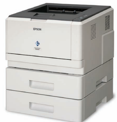
AL-M2400DN's paper capacity can be extended to 800 sheets with two optional additional paper trays.