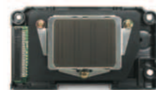
The Epson B-510DN benefits from the same printhead technology as large format printers.