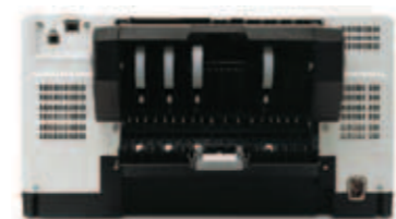
Standard duplex unit, for fast automatic printing on both sides of the page