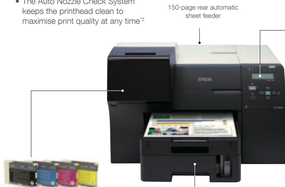
Individual high capacity ink tanks