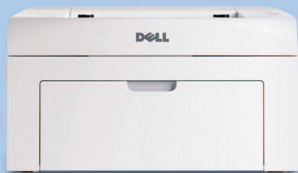
Dell Laser Printer 1110

Produce crisp and sharp monochrome documents with the Dell Laser Printer 1110.