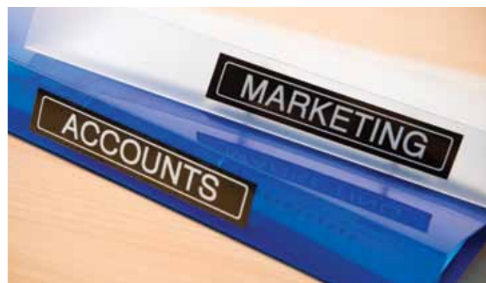
Identify all your important paperwork with clear labelling of file folders

The P-touch 2470, with its easy-to-read backlit LCD, built-in cutter and a choice of font type styles and symbols, gives you the ability to print a wide range of labels. As the P-touch 2470 uses tape cassettes up to 24 mm in width, you can include up to 7 lines of text, and even add a barcode should it be required.