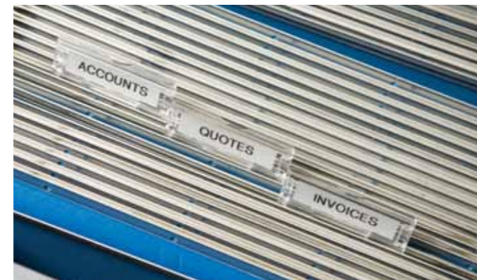
With a wide variety of tape widths available, there is a label for almost any application