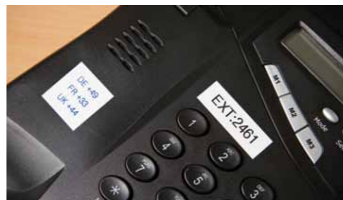
Several lines of text can be printed on each label