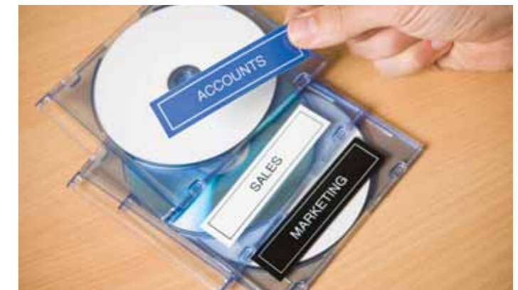
The P-touch 2470 has various features to create the perfect label, quickly and easily