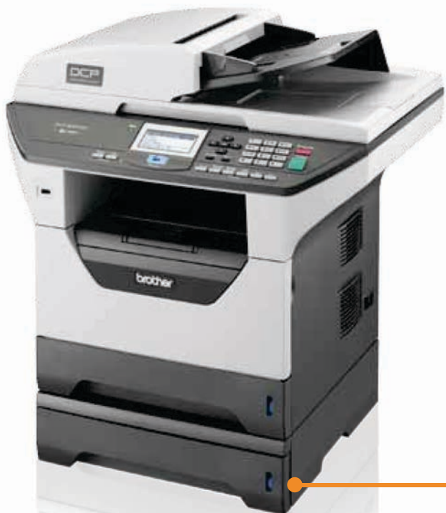
DCP-8085DN (WITH OPTIONAL LOWER TRAY LT-5300)

with colour scanning direct to any network location or FTP site