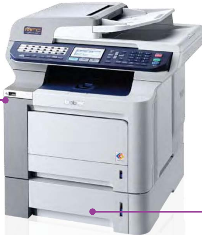
MFC-9840CDW (with optional lower tray)