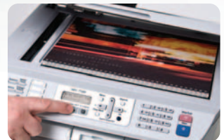
Scanning made simple via the machine control panel