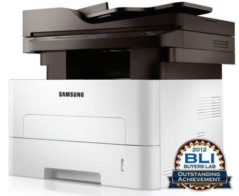
Outstanding Achievement in Innovation: Samsung Easy Eco Driver