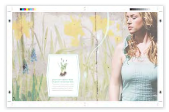
Oversize Output for A3 bleed

The Phaser 7800 colour printer gives graphic arts professionals an impressive range of business-ready finishing options to choose from. Depending on your needs and budget, you can go with the all-in-one Professional Finisher and get stacking, stapling, hole punching, booklet making and v-folding; or start with the Office Finisher LX and get stacking and stapling with the flexibility to add separate hole punching, creasing and stapling capabilities as your workload dictates.