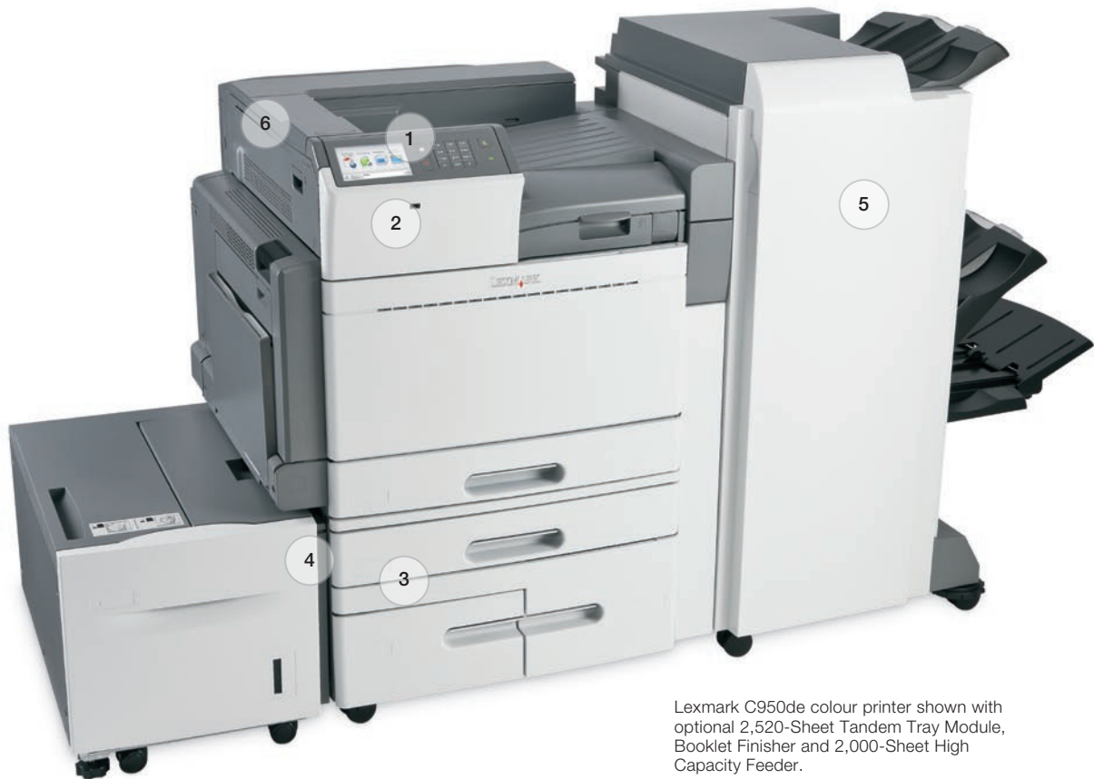
Lexmark C950de colour printer shown with optional 2,520-Sheet Tandem Tray Module, Booklet Finisher and 2,000-Sheet High Capacity Feeder.