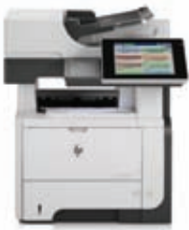
(HP LaserJet Enterprise 500 MFP M525dn)