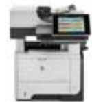
flow MFP M525c