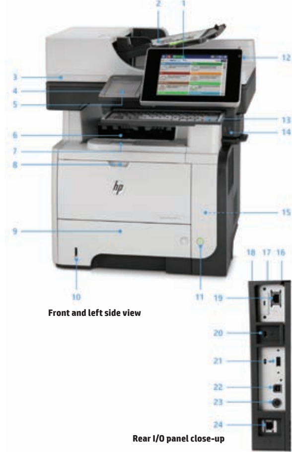
Front and left side view