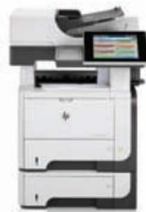
(HP LaserJet Enterprise 500 MFP M525f Series with optional 500-sheet tray)