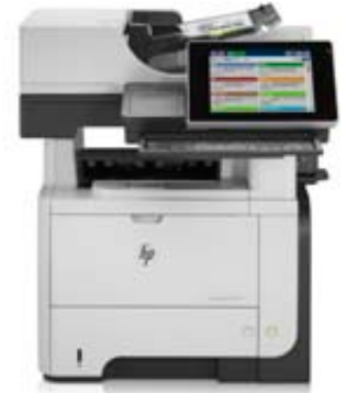
(HP LaserJet Enterprise flow MFP M525c)

Mobile Printing Capability: 3 HP ePrint, Apple AirPrint™