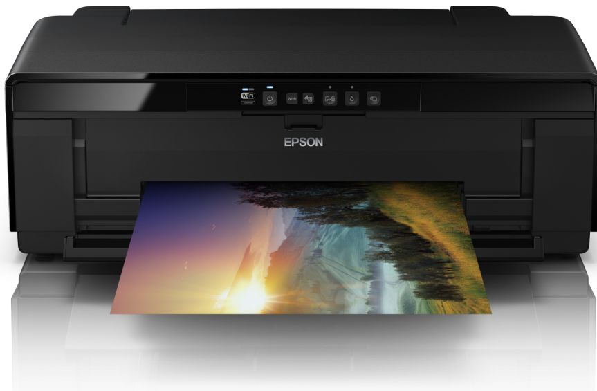
Photo enthusiasts can create professional-quality photo prints on a range of media in the home and studio

The SC-P400 combines professional pigment inks and enhanced connectivity in one affordable package. Perfect for creating glossy photos in sizes up to A3+, it provides the ideal entry into professional photo printing. It also comes with a range of mobile printing options and flexible connectivity features, making it extremely easy to use.