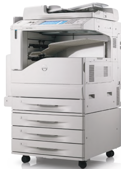
Dell™ Colour Multifunction Printer - C7765dn

Make demanding business printing needs easy with the C7765dn multifunction printer.