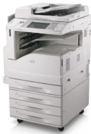
Configuration 1 (Standard)