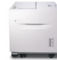
2,300-sheet High Capacity Feeder