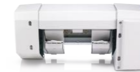
Booklet Maker Unit for Base Finisher