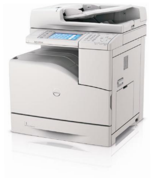
Dell™ Colour Multifunction Printer - C5765dn

Outstanding value, low cost per page, high reliability and scalability make the C5765dn a versatile solution for demanding business printing needs.