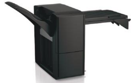
1,000-sheet Base Finisher