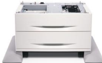
1,100-sheet High Capacity Feeder