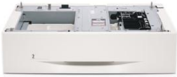
550-sheet input drawer